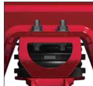
At Site Rating