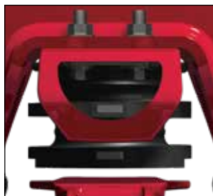
Lightweight Body (unloaded)