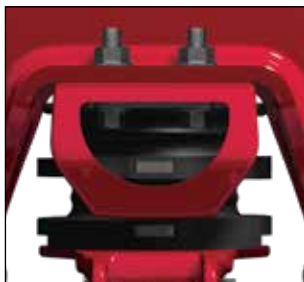
Heavy Body (e.g. mixer - unloaded)