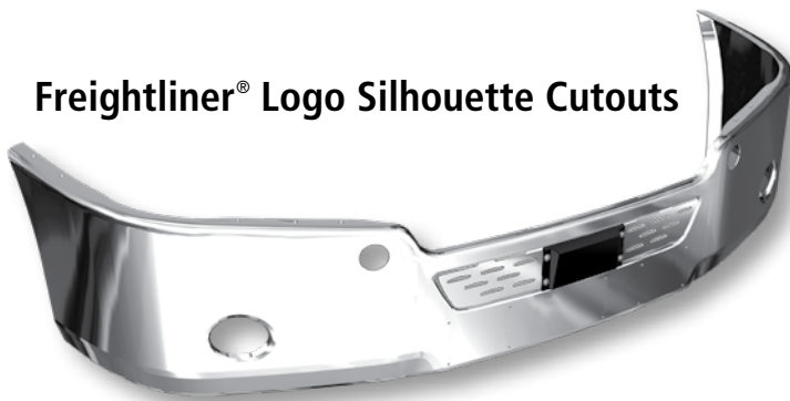
Freightliner® Logo Silhouette Cutouts

*Black plastic cover not included with radar versions