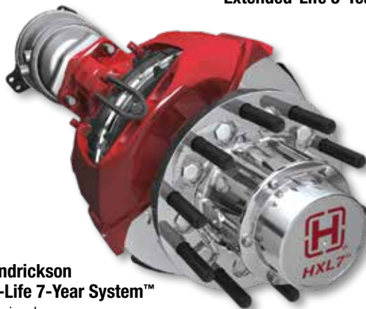
HXL7® Hendrickson Extended-Life 7-Year System™ Disc brake version shown