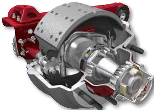
HXL3® Hendrickson Extended-Life 3-Year System™