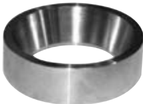
Part No. 66086-001L