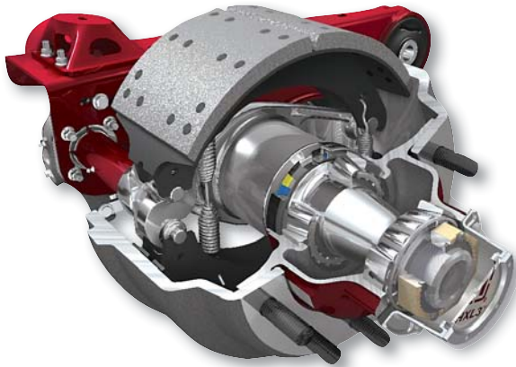
HXL3 ® Hendrickson Extended-Life 3-Year System™