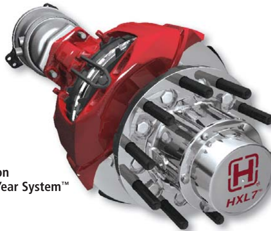
HXL7 ® Hendrickson Extended-Life 7-Year System™ Disc brake version shown