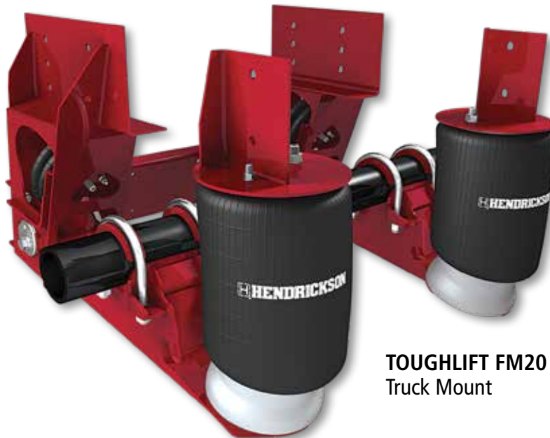
TOUGHLIFT FM20 Truck Mount

Hendrickson offers a wide variety of auxiliary lift axles to meet the requirements of demanding application. The TOUGHLIFT ® FM Series is engineered for rugged on- and off-highway applications accommodating a wide range of ride heights for both truck and trailer applications. Hendrickson's TRI-FUNCTIONAL ® Bushing helps absorb brake and acceleration forces while providing superior roll-control. The QUIK-ALIGN ® feature simplifies the alignment process by eliminating welding of the alignment collar. Capacities available up to 25,000 lbs. in both pusher and tag axle configurations.