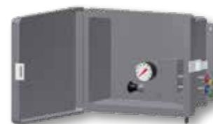
Outside Mounted Composite or Stainless Steel Box