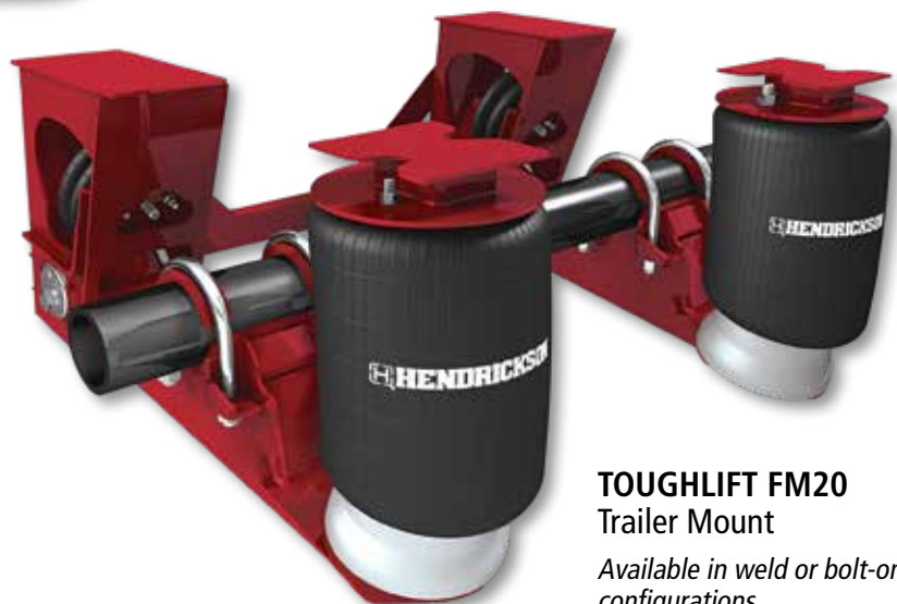
TOUGHLIFT FM20 Trailer Mount

Available in weld or bolt-on configurations