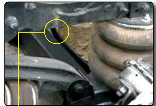
CTR absorbs strike and returns to original state.