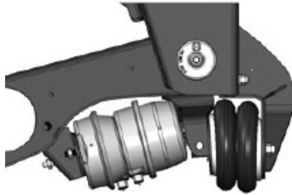
Figure 2: UBL-401 with TSE Ultralife 30/30 Long chamber

IMPORTANT: To ensure proper suspension safety, operation and performance, as well as warranty coverage, the above applicable installation and maintenance requirements must be followed.