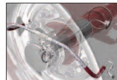
TIREMAAX® tire inflation system

Actual product performance may vary depending upon vehicle configuration, operation, service and other factors.