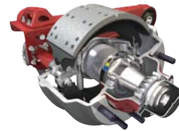
HLS wheel end

Call your trailer dealer or Hendrickson at 866-RIDEAIR (743-3247) to move up to INTRAAAX for your raised-center axle applications.