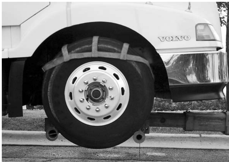
Figure 6-1 Wheel lift method

This method provides the greatest ease for towing the vehicle. Lifting at the tires helps reduce the risk of possible damage to the axle, suspension, and engine components during towing operations, see Figure 6-1.