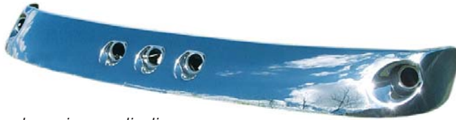
Grill surround and sunvisor applications

The same technology used in HENDRICKSON AERO BRIGHT® bumpers provides Hendrickson customers with the unique opportunity to explore other avenues such as grill surrounds, light bezels, sunvisors and other truck components. Contact your OEM for availability of these products.