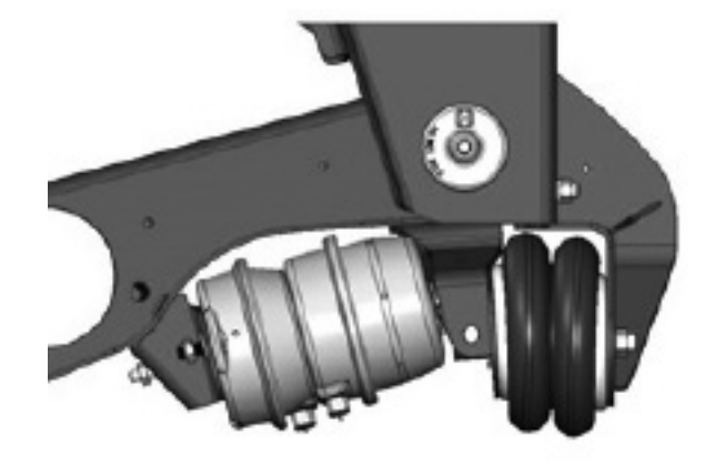
Figure 2: UBL-401 with TSE Ultralife 30/30 Long chamber

IMPORTANT: To ensure proper suspension safety, operation and performance, as well as warranty coverage, the above applicable installation and maintenance requirements must be followed.