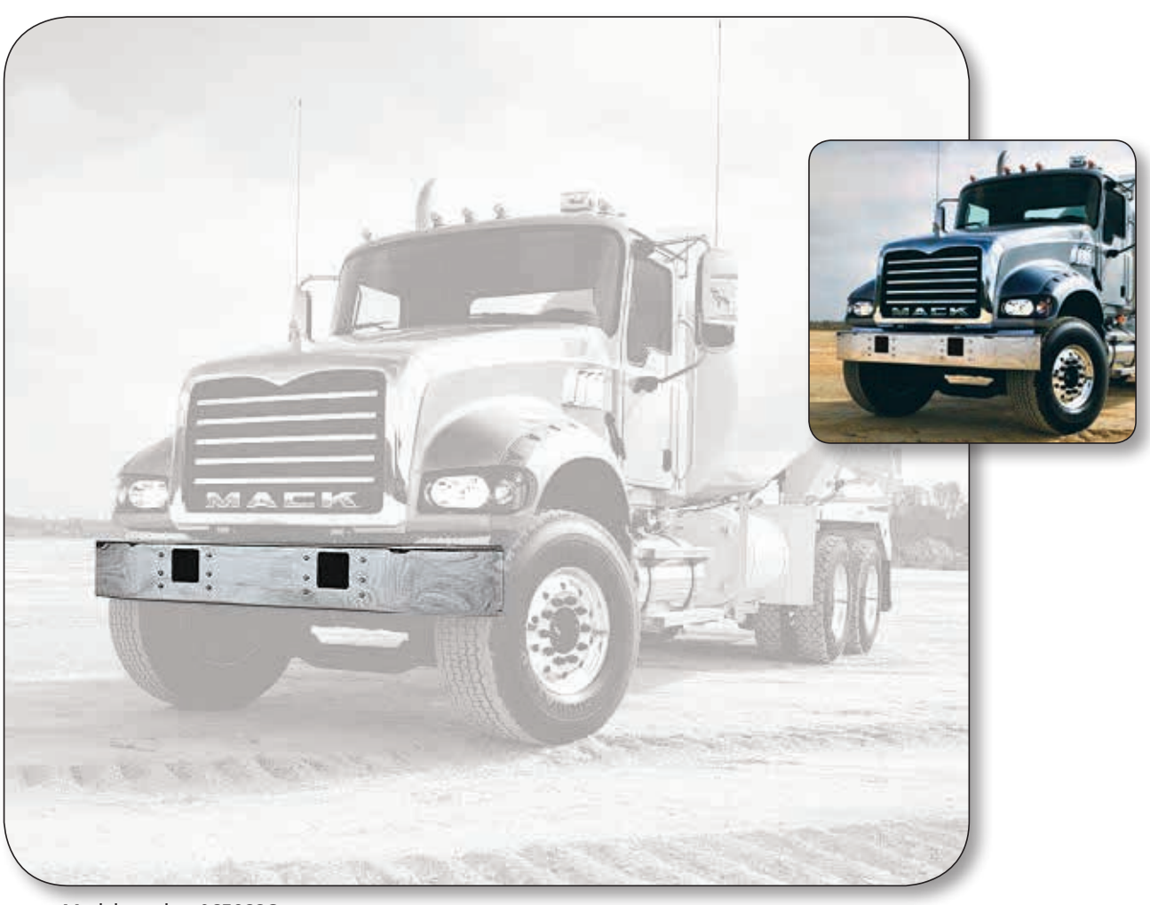
Model number 0658SSC

* Contact your local Hendrickson representative for complete warranty terms, conditions and limitations.