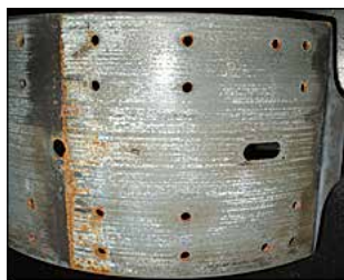
Hendrickson AAXTREME COAT