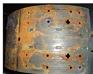
Competitor Premium Coating