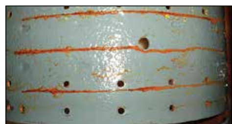
Competitor Premium Coating