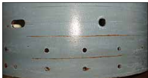
Hendrickson AAXTREME COAT

AAXTREME COAT premium brake coating withstood over 1,000 hours of salt spray testing and rigorous cyclic corrosion testing designed to mimic real-world environmental conditions.