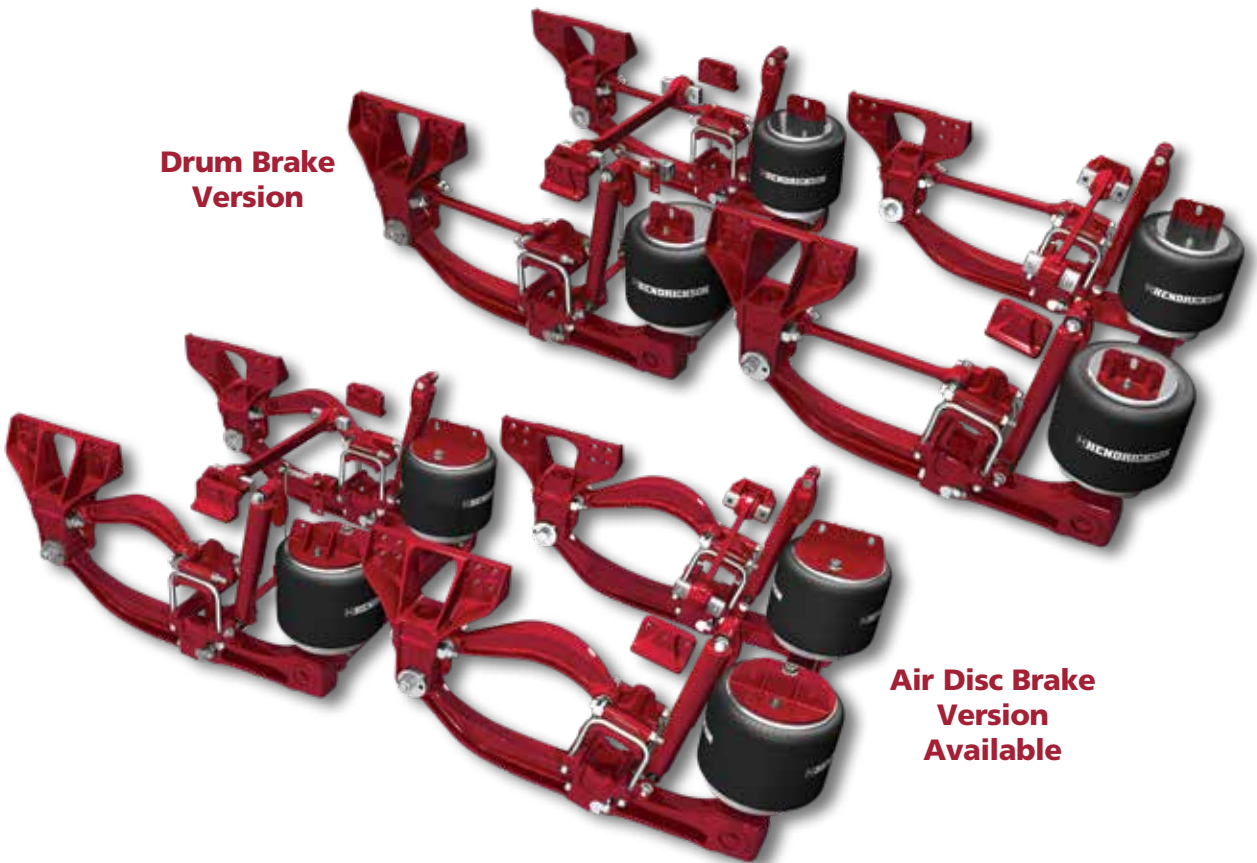
Air Disc Brake Version Available