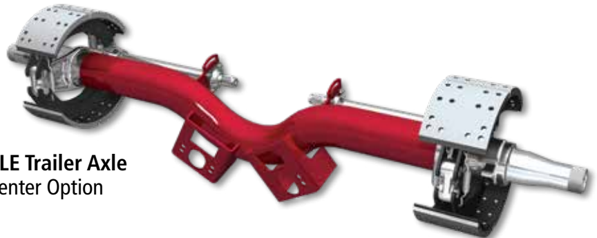
TRLAXLE Trailer Axle Drop Center Option