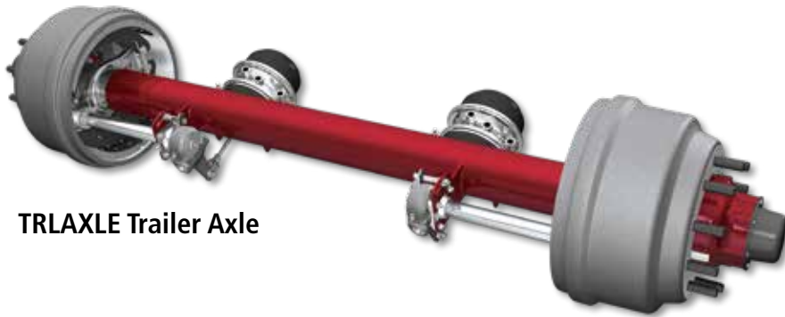
TRLAXLE Trailer Axle