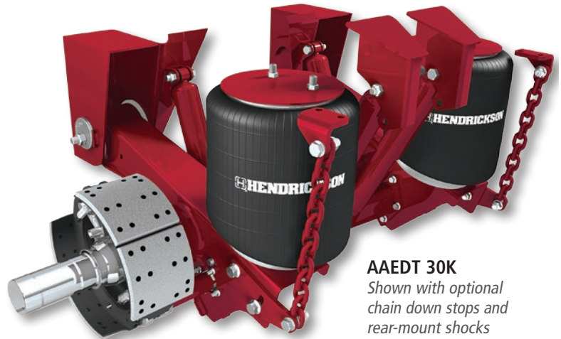
AAEDT 30K Shown with optional chain down stops and rear-mount shocks