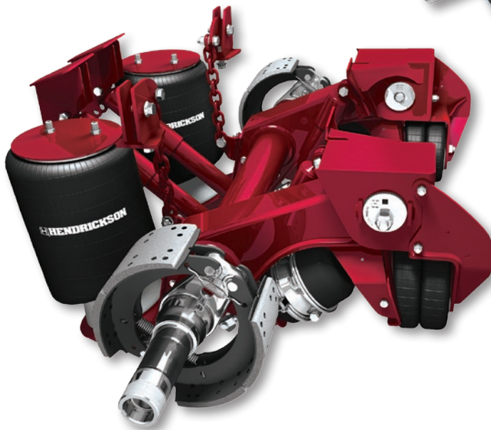
AAEDL 30K Shown with optional chain down stops, rear-mount shocks and UBL™ UNDER BEAM LIFT™